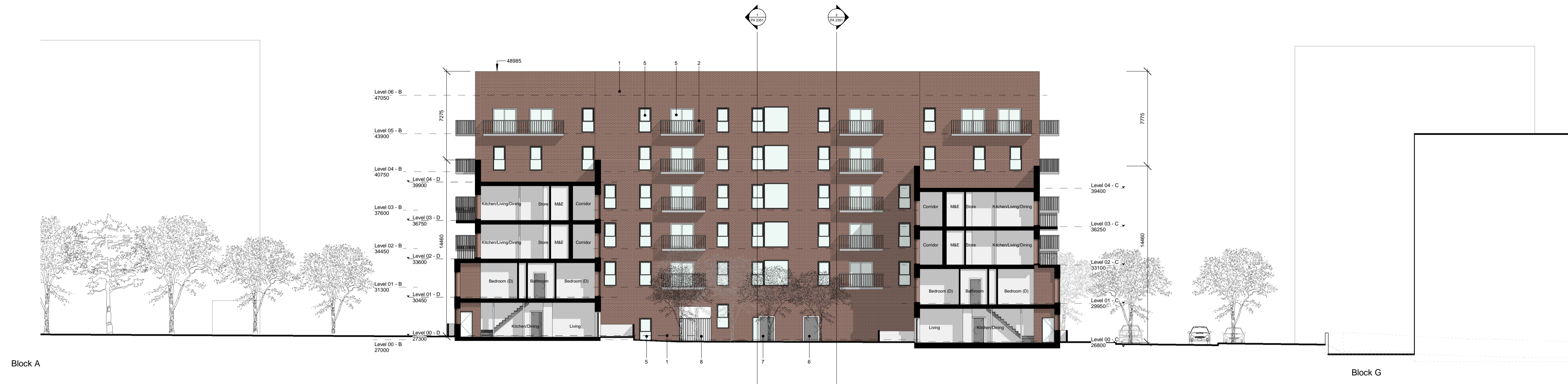
1 Block E - Section East 1 : 200