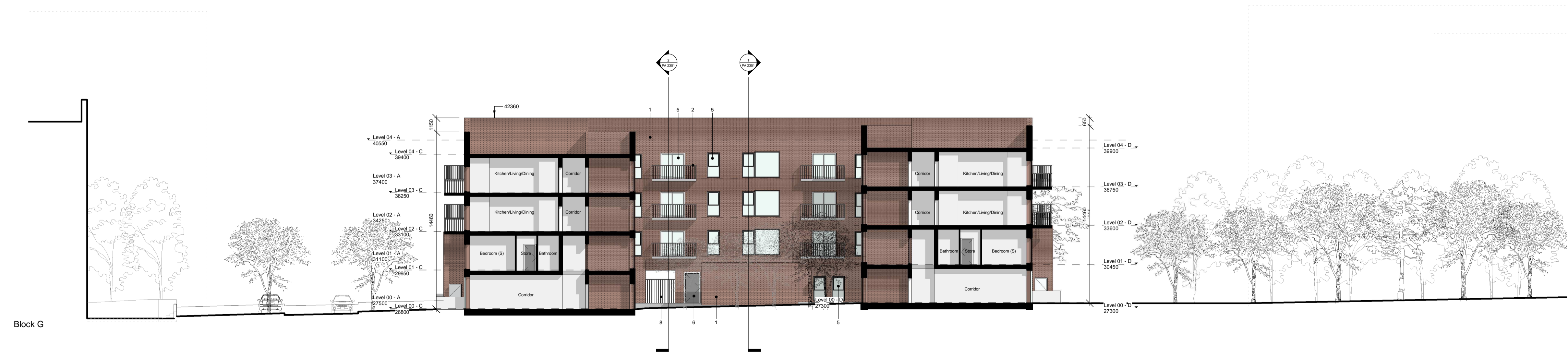
2 Block E - Section West 1 : 200